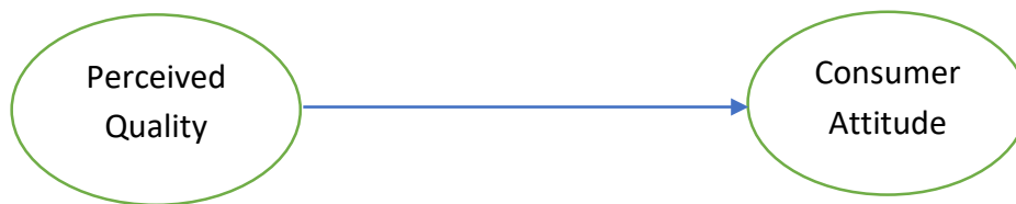
Figure 1: Conceptual Framework